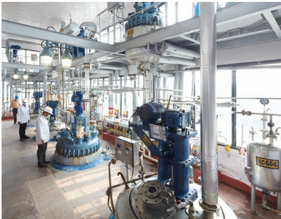
Morepen Lab plant in Baddi

The company's finances soon began to recover, with the debt on the books coming down to ₹340 crore in 2006-07 and then to ₹126.81 crore in 2010-11. Along the way, the net loss on the books came down from ₹42.9 crore in 2010-11 to ₹22.6 two years later. From there, the upward climb continued till the company recorded a tiny profit of